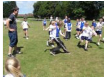
Competition was fierce with everyone having a go!